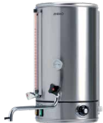
+ WKI - series