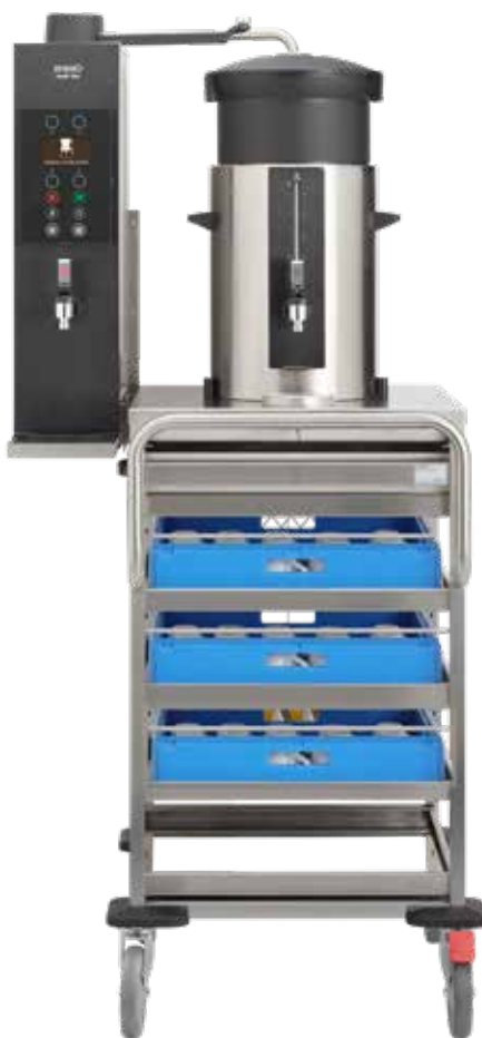
+ Type - SK 10 VL