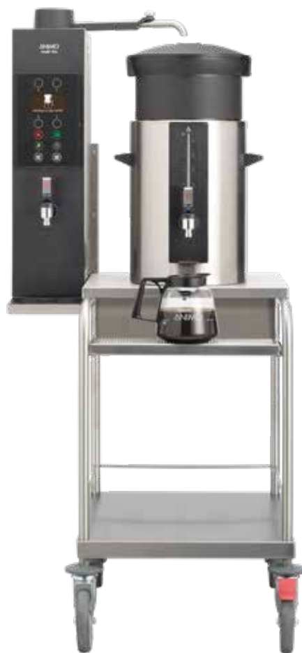
+ Type - S (Type - C is suitable for 2 containers)