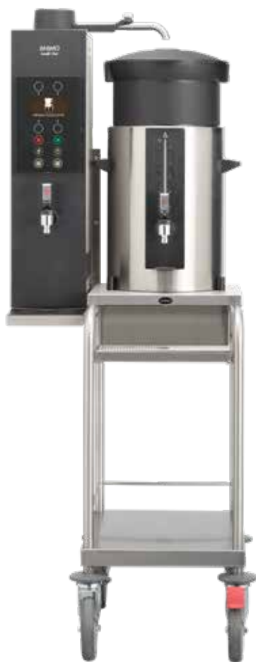
+ Type - J